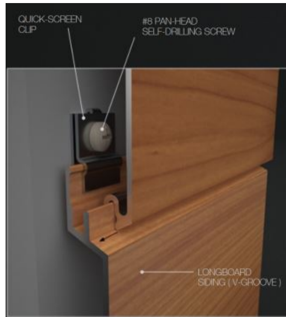
FIGURE 2—QUICK-SCREEN™ CLIP