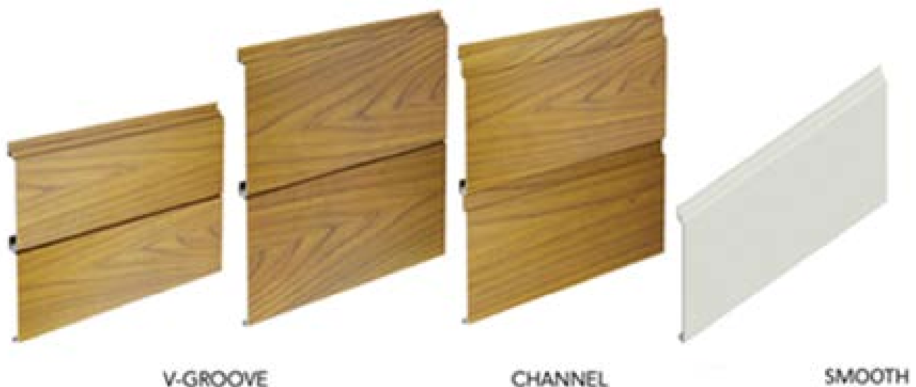
FIGURE 1—LONGBOARD SIDING WITHOUT CONTINUOUS RIB

LONGBOARD ARCHITECTURAL PRODUCTS INC #120-1777 CLEARBROOK RD ABBOTSFORD, BRITISH COLUMBIA V2T 5X5 CANADA (604) 607-6630 www.longboardproducts.com info@longboardproducts.com