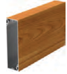
Link & Lock™ Batten