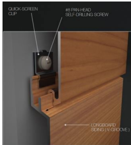
FIGURE 3—QUICK-SCREEN™ CLIP