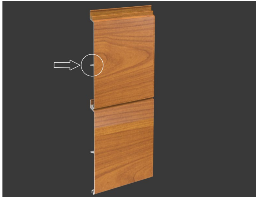
FIGURE 2—LONGBOARD SIDING WITH CONTINUOUS RIB HIGHLIGHTED BY ARROW