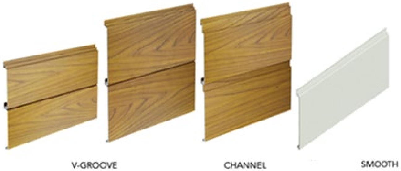
FIGURE 1—LONGBOARD SIDING WITHOUT CONTINUOUS RIB