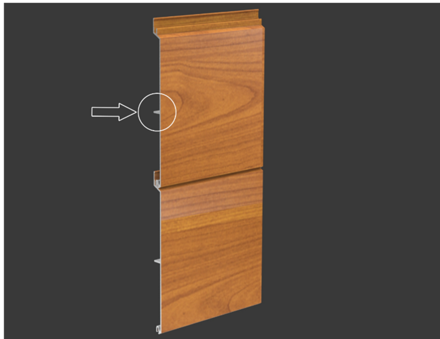
FIGURE 2—LONGBOARD SIDING WITH CONTINUOUS RIB HIGHLIGHTED BY ARROW