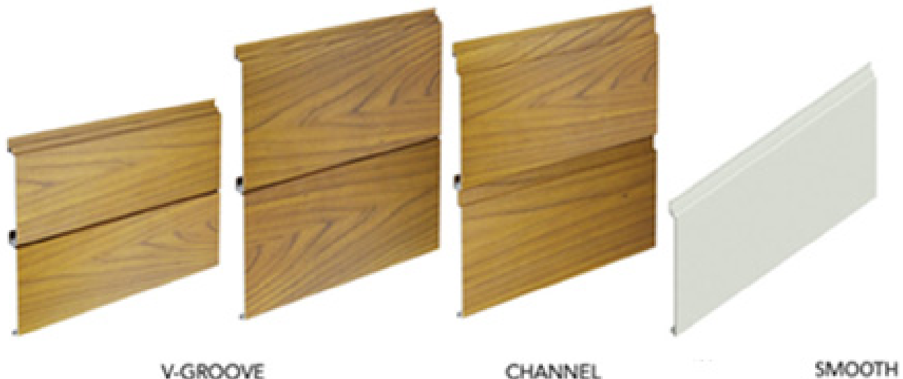
FIGURE 1—LONGBOARD SIDING WITHOUT CONTINUOUS RIB

LONGBOARD ARCHITECTURAL PRODUCTS INC #120-1777 CLEARBROOK RD ABBOTSFORD, BRITISH COLUMBIA V2T 5X5 CANADA (604) 607-6630 www.longboardproducts.com info@longboardproducts.com