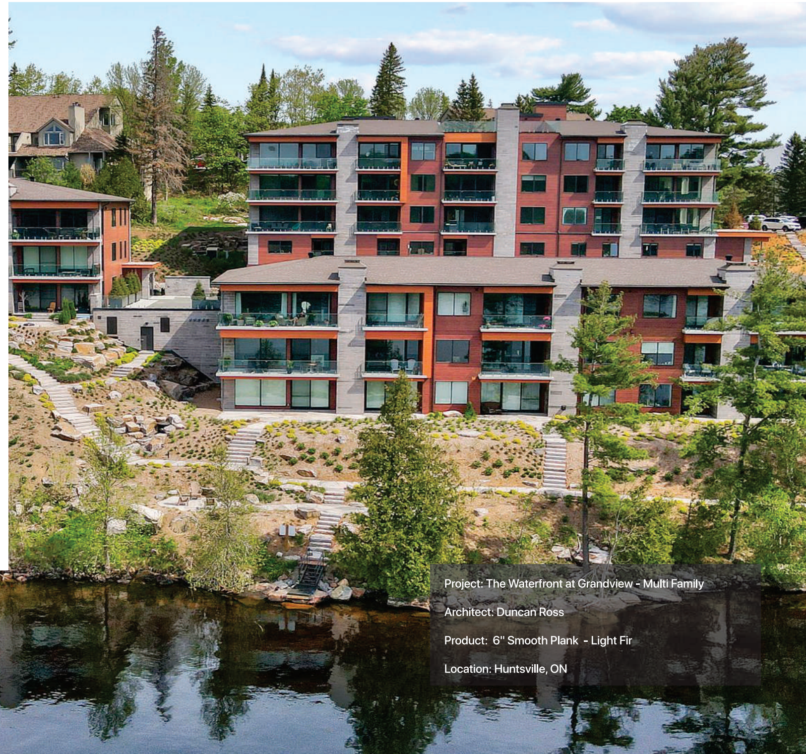
Project: The Waterfront at Grandview - Multi Family Architect: Duncan Ross Product: 6" Smooth Plank - Light Fir Location: Huntsville, ON